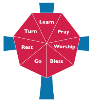
THE WAY OF LOVE Practices for Jesus-Centered Life

There are so many voices in the world, telling us who we are, what we should do, and how we will be fulfilled. They tell us to focus on our desires, on our cravings, on being the best individual we can be. The world, we are told, revolves around each of us.