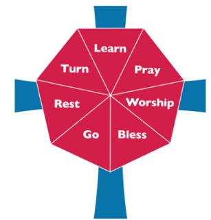
THE WAY OF LOVE Practices for Jesus-Centered Life

There are so many voices in the world, telling us who we are, what we should do, and how we will be fulfilled. They tell us to focus on our desires, on our cravings, on being the best individual we can be. The world, we are told, revolves around each of us.