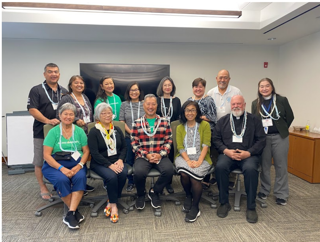
The Japanese Convocation met in NYC in 2023.