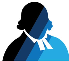
ABSALOM JONES FUND

Historically Black colleges and universities (HBCUs) were founded to create dynamic, supportive, and empowering educational environments for young people from diverse backgrounds. Today there are more than 100 HBCUs in the