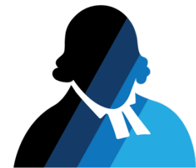
ABSALOM JONES FUND

Historically Black colleges and universities (HBCUs) were founded to create dynamic, supportive, and empowering educational environments for young people from diverse backgrounds. Today there are more than 100 HBCUs in the