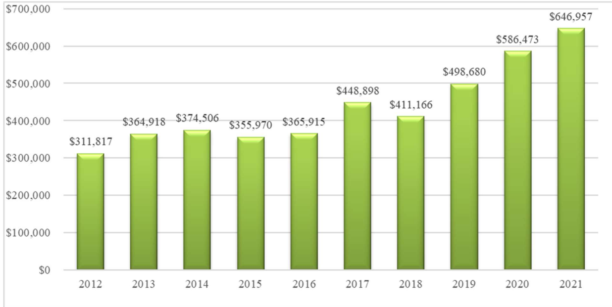
Portfolio Value 2012-2021 (000's)

The chart below summarizes the valuation of the portfolio since 2012.