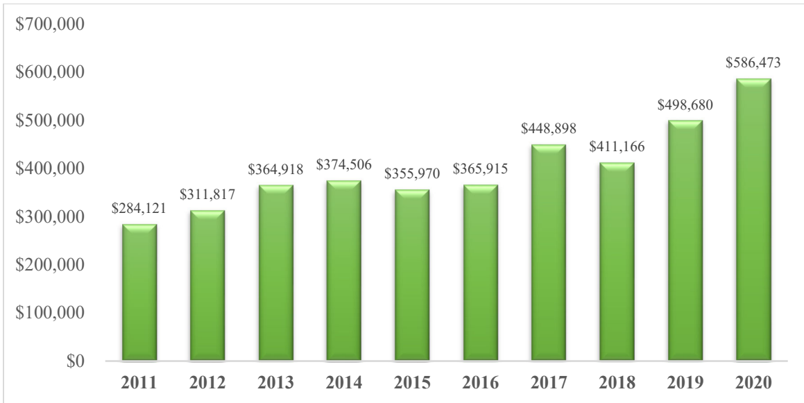
Portfolio Value 2011-2020 (000's)

The chart below summarizes the valuation of the portfolio since 2011.