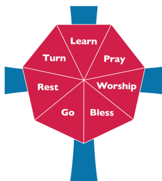
THE WAY OF LOVE Practices for Jesus-Centered Life

Obedying this call means recognizing the things we put first in our lives, the things we allow to have the most space in our minds, our fears and hopes and desires. And turning instead toward love.