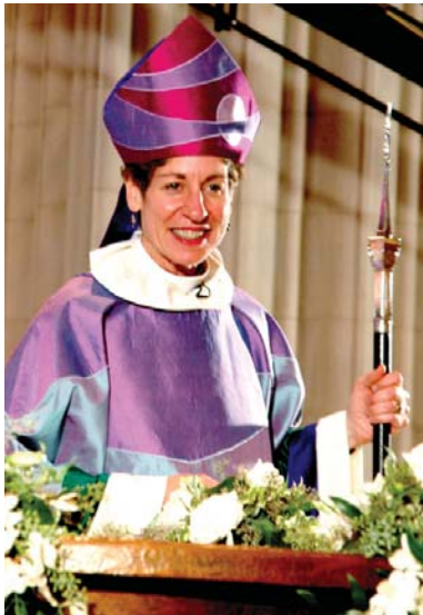
Katharine Jefferts Schori