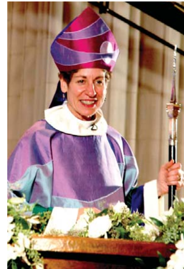
Katharine Jefferts Schori