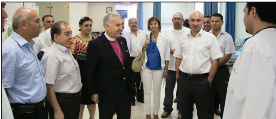
St. Luke's Hospital in Nablus, West Bank