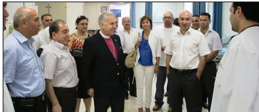
St. Luke's Hospital in Nablus, West Bank