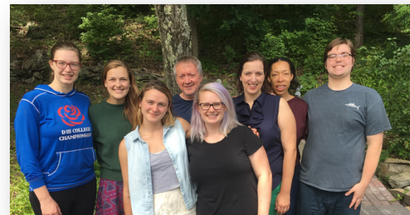
Some of this year's YASCers and Episcopal Volunteers in Mission.