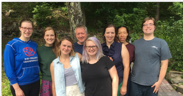
Some of this year's YASCers and Episcopal Volunteers in Mission.