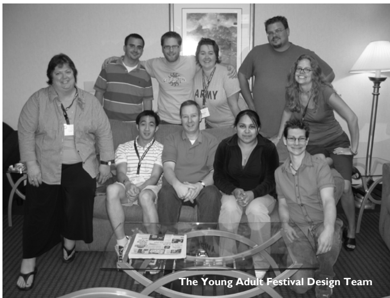
The Young Adult Festival Design Team

On behalf of the design team, welcome to Columbus! We are incredibly excited you are here and have accepted our invitation to be a part of this festival and strengthen the young adult presence at General Convention. The design team has been working hard this past year preparing for you, and we are all delighted that you are now here.